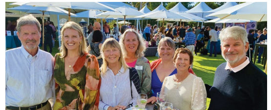
More than 500 people attended our 24th Annual Celebrate Wellness Event at the South Coast Botanic Garden in October.