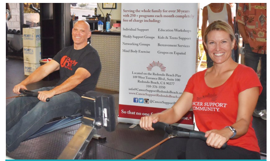
The 6th Annual Row for a Reason event, hosted by Body One Fitness in Redondo Beach, raised more than $22,000 for CSC South Bay.