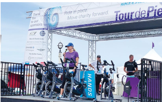
CSC South Bay partnered with the Hirshberg Foundation for Pancreatic Cancer Research for the 9th Annual Tour de Pier.