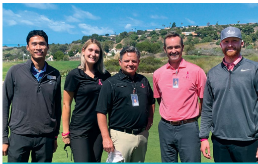
The Links at Terranea held its 7th Annual Birdies for Breast Cancer event, supporting CSC South Bay.