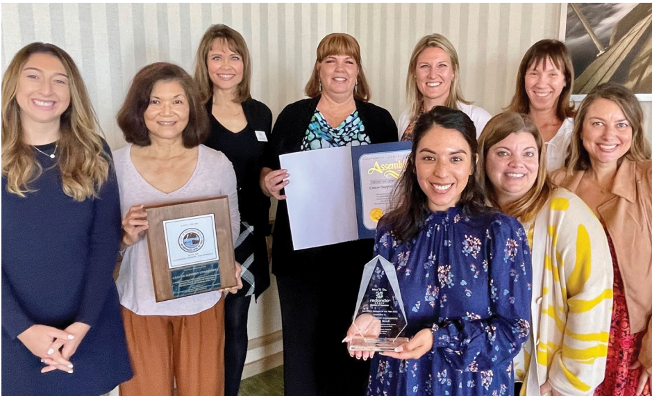
Cancer Support Community South Bay was honored to be named Nonprofit Business of the Year by the Redondo Beach Chamber of Commerce at their annual Community Awards Ceremony held at the Portofino Hotel.