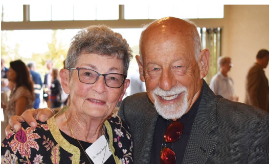
Members of CSC South Bay's Victor's Circle and Legacy of Hope Society were honored at the annual appreciation dinner.